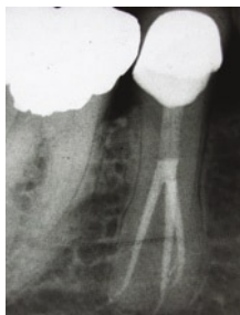
Complex apical anatomy

specialist practice as it provides very consistent results and enables the referring dentist to concentrate on restoring the crown of the tooth with confidence.